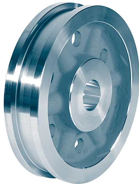
Form B broad crane wheel

Designation of a wheel form B with nominal- \varnothing d1 = 630 mm, gauge b1 = 100 mm, bore- \varnothing d3 = 180 mm H7: