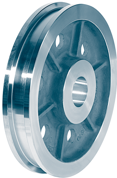
Form S narrow crane wheel