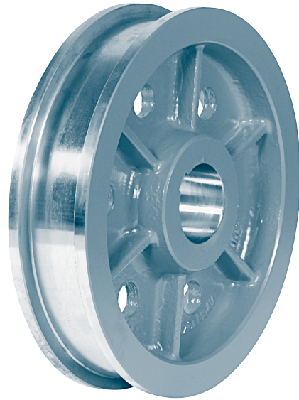
Crane wheel body A 630 × 110 (broad type)

Designation of a wheel with nominal- \varnothing d1 = 400 mm, gauge b2 = 80 mm, bores- \varnothing d3 = 105 H7, with feather keyway acc. to DIN 6885-1: